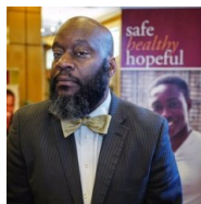
Anthony D. Smith