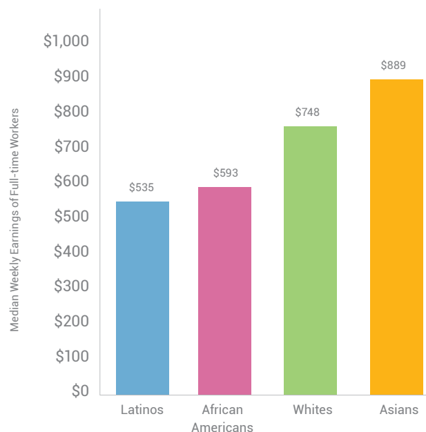
The Racial Gap in Earnings, 2008