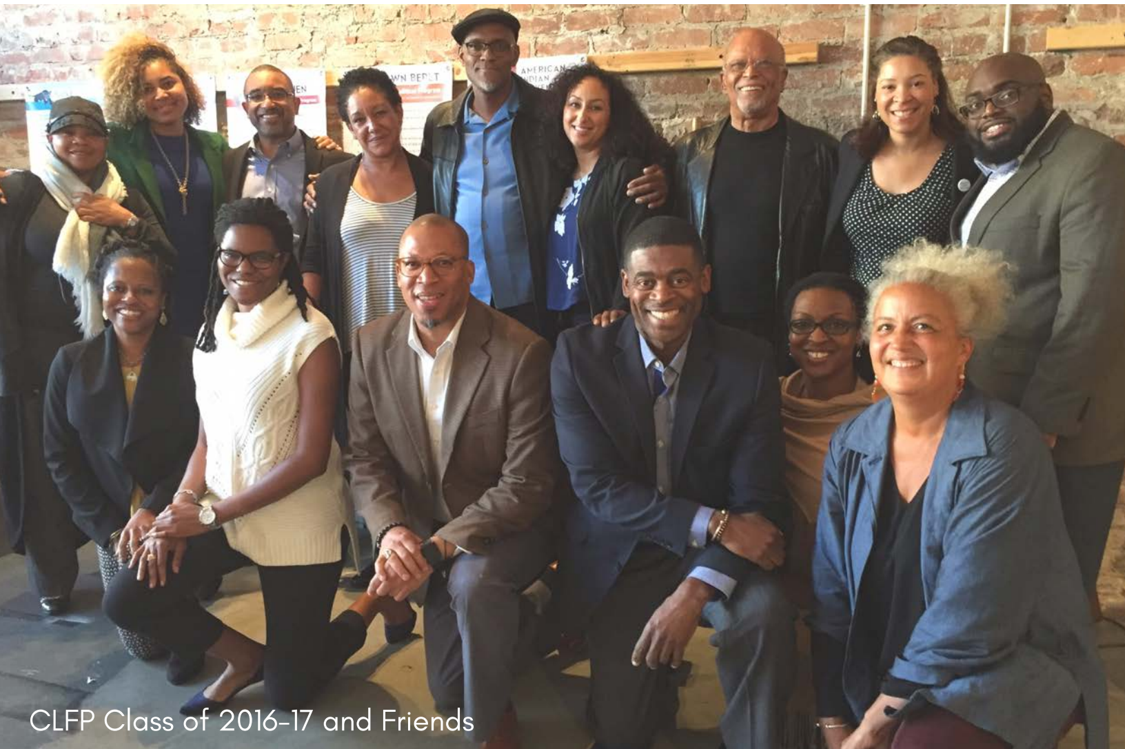
CLFP Class of 2016-17 and Friends